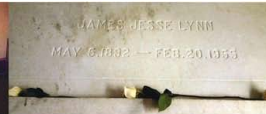
Forest Hill Cemetery - Kansas City, MO