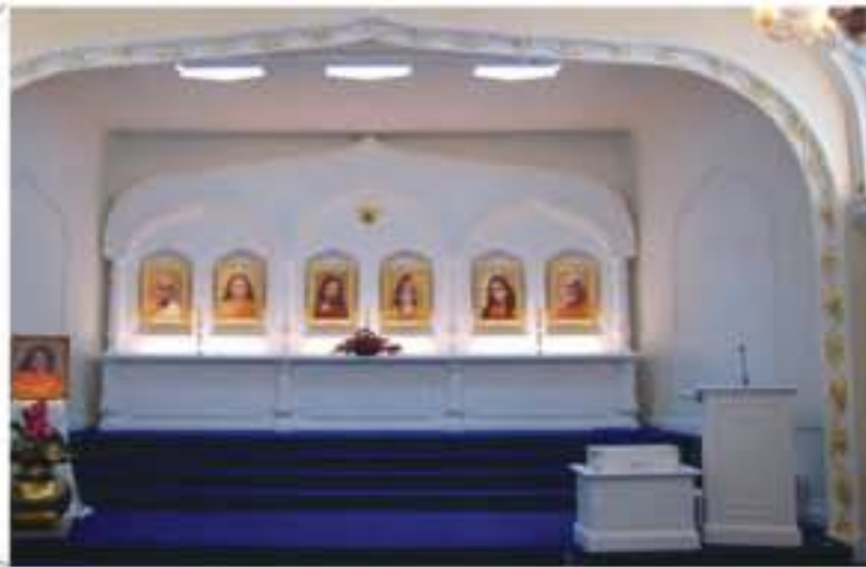
EXAMPLE OF COMPLETED ALTAR