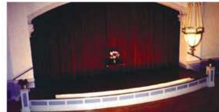
The Athenaeum Auditorium where Paramahansa Yogananda spoke in 1932